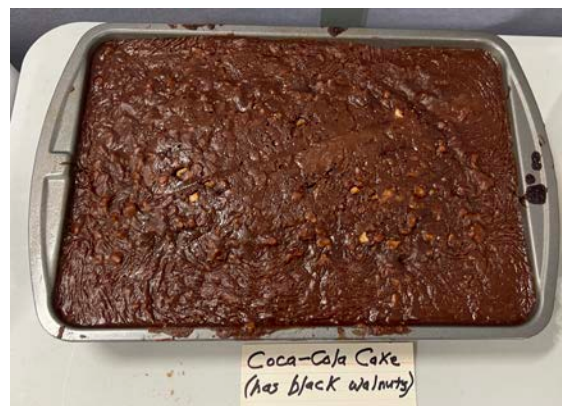
Coca-Cola Cake (has black walnuts)