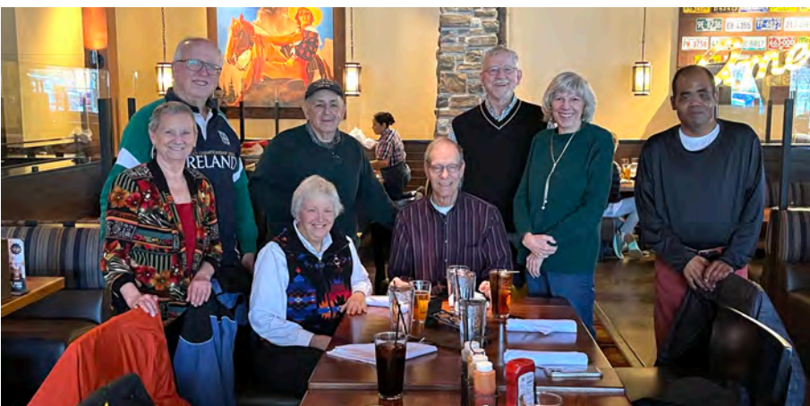
Lazy Dog in Fair Oaks on 03-15-2023